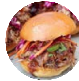
BBQ Pulled Pork Sliders 28 pieces $90

Bao bun filled with karaage chicken and salad topped with Japanese mayonnaise