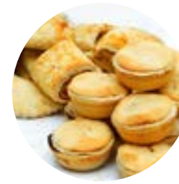
Assorted Pastries 36 pieces $65

Tomato & basil arancini served with a sugo sauce & parmesan