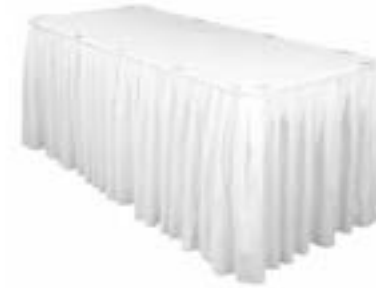
BRIDAL TABLE SKIRT 8m $60 2 available