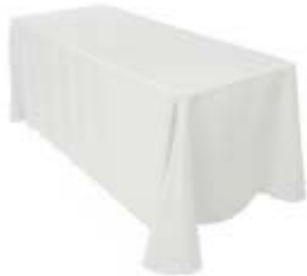
WHITE OR BLACK LINEN TABLECLOTH 224cm x 224cm (trestle) $7