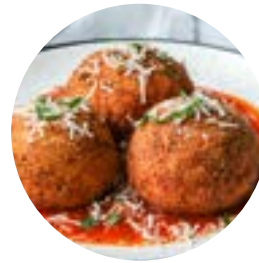
Arancini Balls 25 pieces $60

Chicken skewers marinated in a sticky mango sauce