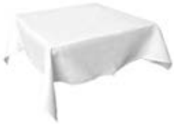
WHITE OR BLACK LINEN TABLECLOTH 137cm x 137cm (square) $5