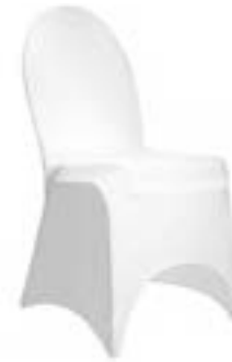
LYCRA CHAIR COVER $3 each 200 available