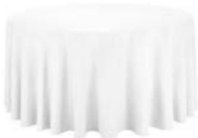
WHITE OR BLACK LINEN TABLECLOTH 3.2m x 3.2m (round) $10