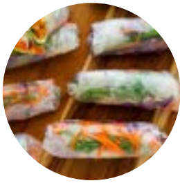
Vegetarian Rice Paper Rolls 24 pieces $60

Rice Paper rolls filled with vegetables and vermicelli noodles served with a peanut dipping sauce