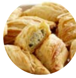
Spinach & Feta Pastizzis 30 pieces $60

Mini quiche tarts filled with roasted pumpkin and chorizo