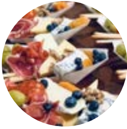
Fruit Boats $70 Charcuterie Boats $110

Baguettes filled with chicken, ham, salami and salads