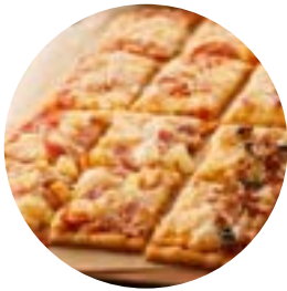
Pizza 15 pieces $50

Vanilla and chocolate custard filled mini cannolis or mini churros with caramel sauce