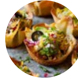
Mini Tacos 24 pieces $70

Party pies, sausage rolls and pasties served with tomato sauce