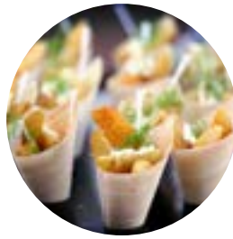
Potato Wedges 20 pieces $50

Lightly seasoned potato wedges served in cones with a sweet chilli mayo