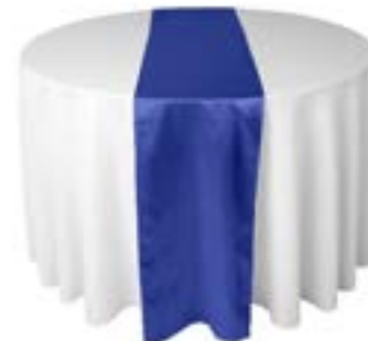
SATIN OR ORGANZA TABLE RUNNER $2.50 each