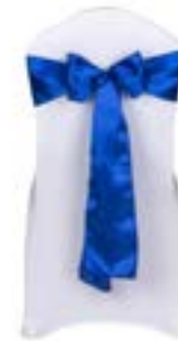
SATIN OR ORGANZA CHAIR SASH $2.50 each