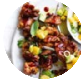
Mango Chicken Skewers 24 pieces $60

Filo pastry filled with a blend of spinach and feta