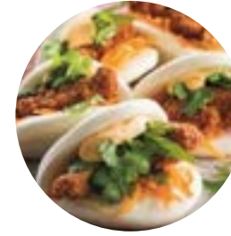
Karaage Chicken Bao Buns 20 pieces $80

Salt & pepper battered squid cones served with a lemon slice