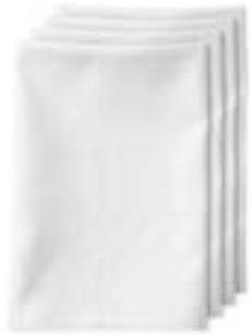
WHITE OR BLACK LINEN NAPKIN 50cm x 50cm $1 each