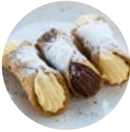
Cannolis or Churros 30 pieces $50

20 x single serve charcuterie or fruit filled boats